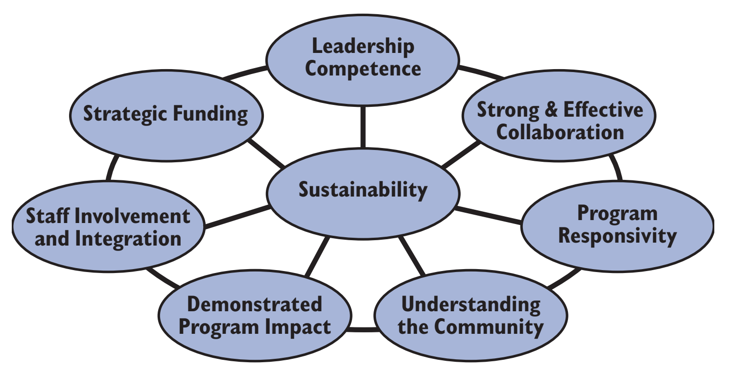
Figure 1. The seven major elements of program sustainability